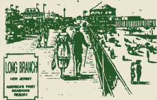
LONG BRANCH HISTORICAL ASSOCIATION