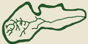
WHALE POND BROOK WATERSHED ASSOCIATION

Funding has been made possible in part by an operating support grant from the New Jersey Historical Commission, a Division of the Department of State, through grant funds administered by the Monmouth County Historical Commission.