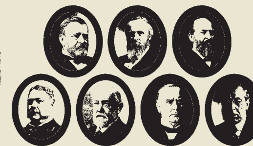
11 PRESIDENT GALLERY The Boardwalk between Laird Ave & S. Broadway

The Great Iron Pier is long gone, but need not be forgotten. Go to the center of Pier Village Plaza, at the gazebo on the promenade & look up. There is the imprint of the majestic twin towers that once stood at the entrance to the Iron Pier. Fashioned after the West Pier in Brighton England, it is by far the grandest of the Long Branch piers. Constructed to accommodate the large steam ships of the day, tourists could enjoy a round trip for 60 cents. Today, the Pier Village towers are a memory marker of a by-gone era, but not a forgotten dream.