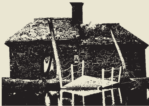
5 ROSS ISLAND 20 Elinore Ave

The Jersey Shore was once known as the "Ship Graveyard" for more than 3000 ships that wrecked off its coast. The Newell Act in 1848 began the Life Saving Service that today is the US Coast Guard.