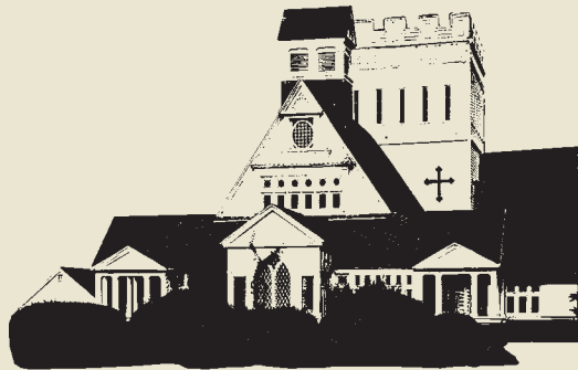
1 CHURCH OF THE PRESIDENTS 1260 Ocean Ave

Built in 1879 for St. James Episcopal Church in East Long Branch. Trenton Diocese deconsecrated the chapel in 1953, when ownership was passed to the Long Branch Historical Museum Association. Placed on the National Register of Historic Places in 1976, its name is in recognition of U.S. Presidents who are associated with Long Branch.