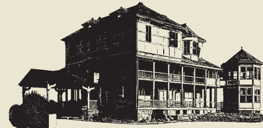
3 GRANT'S COTTAGE 932 Ocean Ave

where he and his wife summered. The problem was he might not be able to make the trip from the train station to the cottage in a horse drawn ambulance. In a truly miraculous feat, that would capture the nation's attention, residents built a spur from the station to the front door of his cottage. Thousands of men worked through the night and on Sept 5, 1881 "Garfield's Spur," as it became known, was completed and the mortally wounded president was transferred to his bedroom in his cottage.