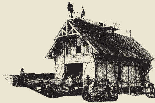
4 TAKANASSEE LAKE & LIFE SAVING STATION #5 Ocean Ave & Lake Dr

President's love of Long Branch began in the 1860's when several of the industrialists, who already summered here, offered their oceanfront cottages. Eventually Grant would own his own summer residence that would be coined "The Summer Capitol".