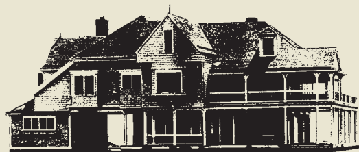
2 PRESIDENT JAMES GARFIELD HISTORIC MARKER Garfield Rd & Ocean Ct

Built in 1879 for St. James Episcopal Church in East Long Branch. Trenton Diocese deconsecrated the chapel in 1953, when ownership was passed to the Long Branch Historical Museum Association. Placed on the National Register of Historic Places in 1976, its name is in recognition of U.S. Presidents who are associated with Long Branch.