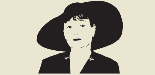
6 DOROTHY PARKER BIRTHPLACE 732 Ocean Ave