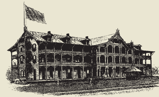
7 THE GRAND HOTELS Ocean Ave & Brighton Ave

site is designated a Literary Landmark by the Friends of the Libraries, USA.