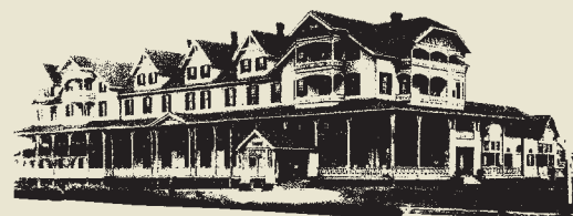
8 SCARBOROUGH HOTEL & NORMAN MAILER Ocean Ave & South Bath Ave

While several of the Grand Hotels stood on this site, The Stetson House (later West End Hotel) was perhaps the grandest one of all. With 300 rooms it wasn't the largest, however, it boasted of the most modern conveniences for the times. When it became the West End, 15 room cottages were added and it was the first hotel in NJ to have an elevator & telegraph services to the NY Stock Exchange. Famous guests included Lillian Russell, Horace Greely, Gen. Sherman, & Oscar Wilde. The marker on this site was included in Monmouth County Archives Day as an example of excellent craftsmanship in history.